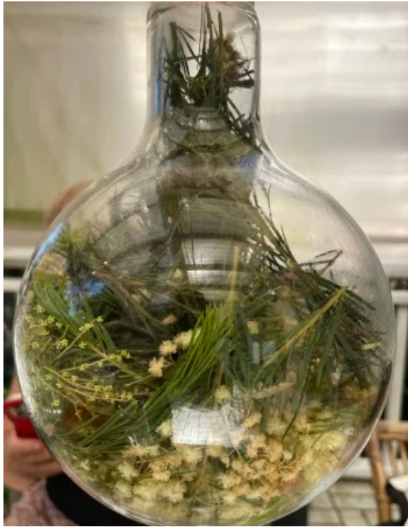
Distillation of floral essences for Disperse

Flatbed scans capture the beauty and idiosyncrasies of Sydney's ironbark species, while another artwork, Torrangora Forest (Torrangora is the local Aboriginal name for the species), records in film the few remaining stands of turpentine-ironbark forest: Wallumatta Reserve in North Ryde and at Macquarie University.