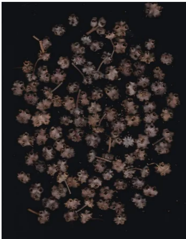
Flatbed scans of ironbark specimens for Disperse

Flatbed scans capture the beauty and idiosyncrasies of Sydney's ironbark species, while another artwork, Torrangora Forest (Torrangora is the local Aboriginal name for the species), records in film the few remaining stands of turpentine-ironbark forest: Wallumatta Reserve in North Ryde and at Macquarie University.