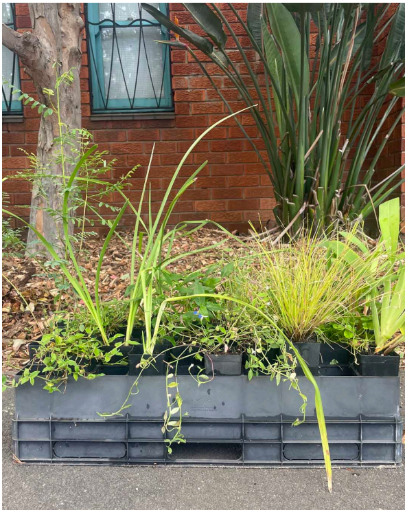
Plants for Threshold

By using our site you accept that we use and share cookies and similar technologies to perform analytics and provide content and ads tailored to your interests. By continuing to use our site, you consent to this. Please see our Cookie Policy for more information.