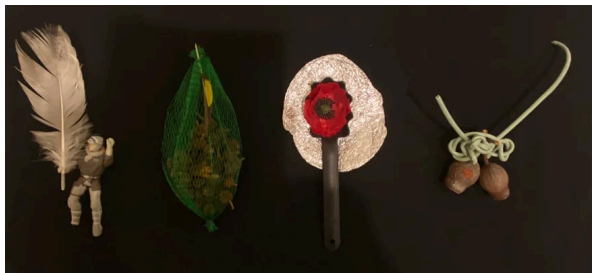
Assemblages of found objects from the series 100 Days

Playful yet striking, the series 100 Days brings together discarded objects and natural materials gathered by the artists. The assemblages invite visitors to reflect on the impact of post-industrial colonial settlement on Gadigal land.